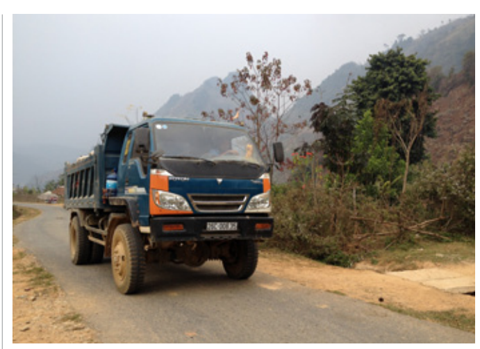
FIGURE 9 TRUCKS TRANSPORTING CONSTRUCTION MATERIALS IN XUAN LAO COMMUNE, DIEN BIEN PROVINCE