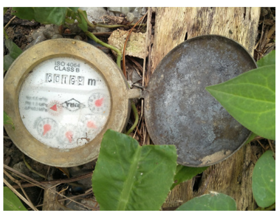
FIGURE 5 WATER METER AT HOUSEHOLD SERVED BY SMALL WATER ENTERPRISE IN MEKONG

"This model is under PCERWASS – they are the ones who facilitate and help to deal with the legal procedures. They have been helpful and supportive. They play an important role. PCERWASS work with the local authority – getting access to free land. They also work with Chairman of the People's Committee and other leaders of other communes to disseminate information about the [bottled water]."