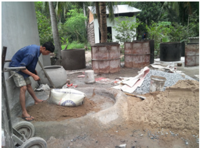
FIGURE 2 SMALL-SCALE ENTERPRISE MANUFACTURING CONCRETE RINGS IN THE MEKONG