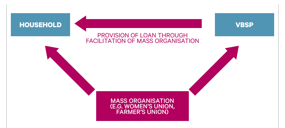
FIGURE 8 MASS ORGANISATIONS AS THE GO-BETWEENS FOR HOUSEHOLDS TO ACCESS LOANS FROM VBSP

For water it goes through Women's Union, sanitation through Farmer's Union." The capacity, awareness and motivation of the designated mass organisation were found to significantly influence the ability of households to access VBSP loans, and given interest in health and sanitation, several interviewees that the Women's Union's was the chosen intermediary for WASH due to its interest in health and sanitation, and that as a result, borrowing for water and sanitation was higher.