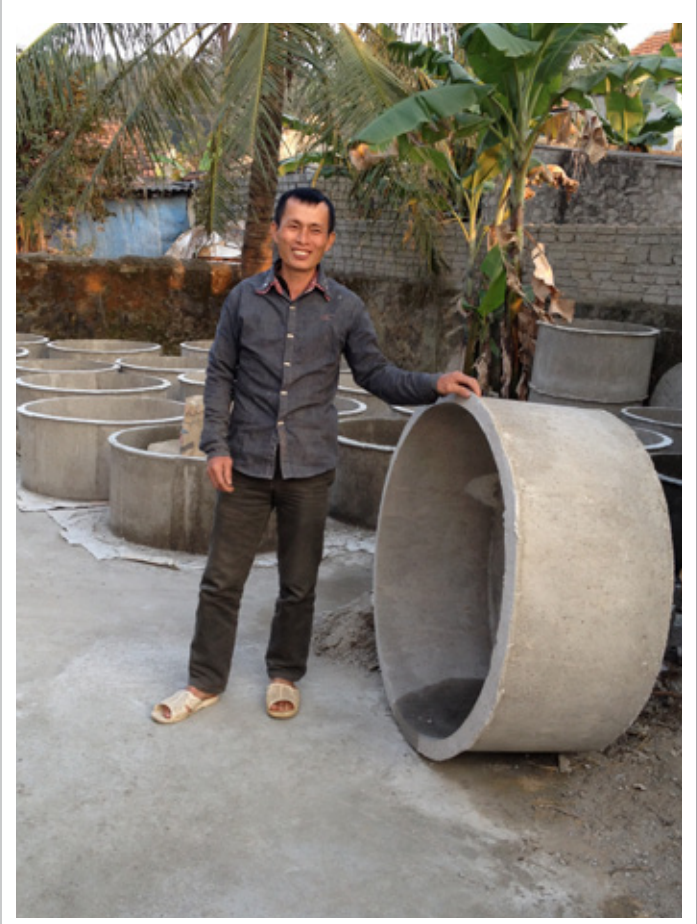
FIGURE 3 A CONCRETE RING PRODUCER IN QUYNH DIEN COMMUNE, NGHE AN PROVINCE