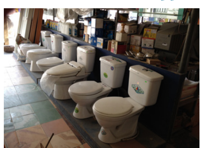
FIGURE 7 SUPPLY SHOP IN QUYNH LUU, NGHE AN PROVINCE