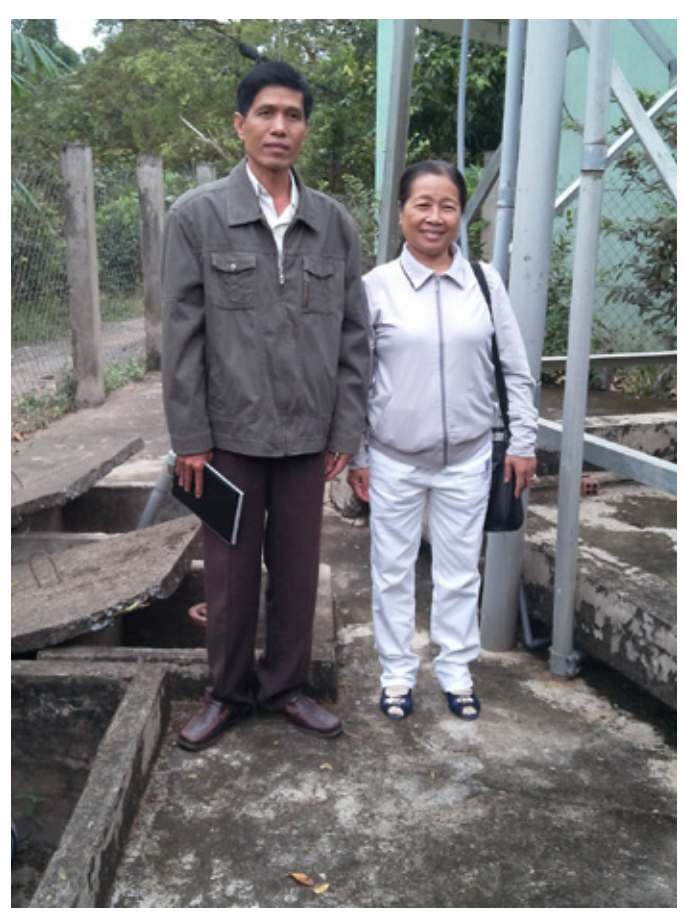
FIGURE 12 WATER ENTERPRISE OWNER AND PROVINCIAL GOVERNMENT STAFF MEMBER IN MEKONG

Building toilets is considered an easy job that can be done by anyone, so skilled masons, especially in more developed areas, orient their business towards house construction. The NGO programmes that have successfully involved local masons engaged mid- to low-skilled masons (sometimes mason assistants), who were interested in managing their own businesses and viewed building toilets as profitable. Conversely, master trainers understood that it was more profitable to orient their business towards bigger and more complex infrastructures. This offers a big opportunity for women who have an entrepreneurial attitude. In Vietnam women are active in the construction sector, but usually as masons' assistants. Providing women masons with the opportunity to develop a niche market (toilet construction) offers a way to change this situation and for women to operate individual businesses.