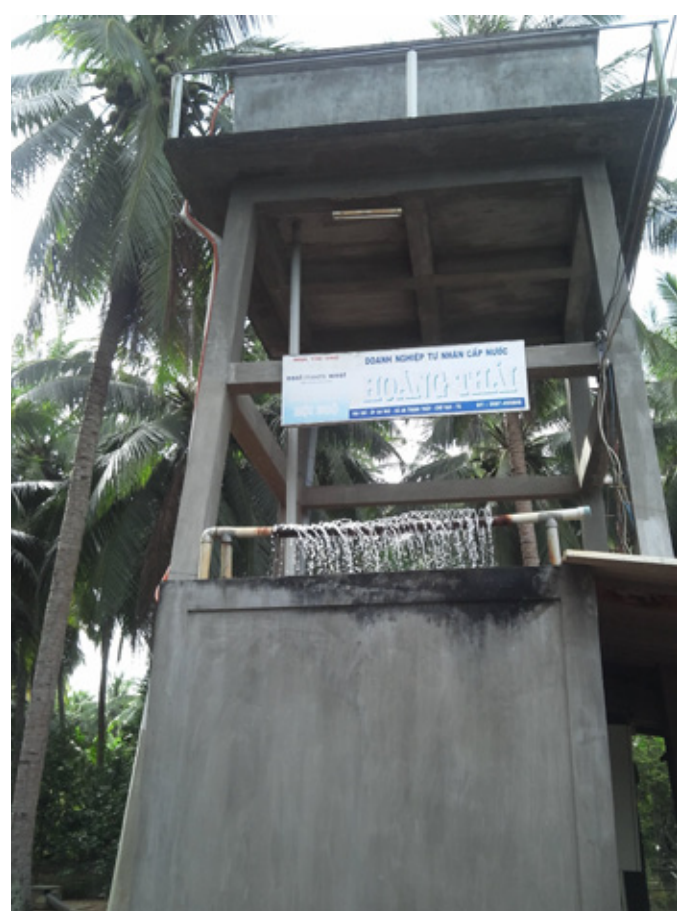
FIGURE 4 SMALL SCALE WATER ENTERPRISE IN THE MEKONG

In fact some enterprises that owned multiple water systems had many staff. For instance one company covering 20 water systems noted that: "I have 20 technicians and 10 collectors. The technicians are paid 3-5 million VND/ month [USD $142-$237/month] and they receive three months' training when they are hired." Enterprises noted that newer systems required less technical work and therefore jobs could be split and hence an employee might play the role of both collector and technician for a water system. Enterprises appeared to choose local staff for these roles: "I hired a local person in each hamlet and trained them."