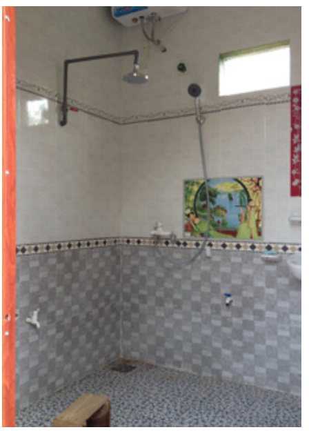
FIGURE 7 LUXURY BATHROOM IN QUYNH LONG COMMUNE, NGHE AN PROVINCE

In-country research revealed numerous households aspired to expensive luxury latrines. The costs were well out of their reach, so they settled for either no latrine or an unimproved pit latrine. One reason for these aspirations was the lack of examples of low cost, desirable hygienic latrines at the commune and village level. In remote rural areas, the only examples villagers knew about were