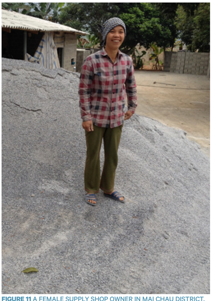
FIGURE 11 A FEMALE SUPPLY SHOP OWNER IN MAI CHAU DISTRICT, HOA BINH PROVINCE