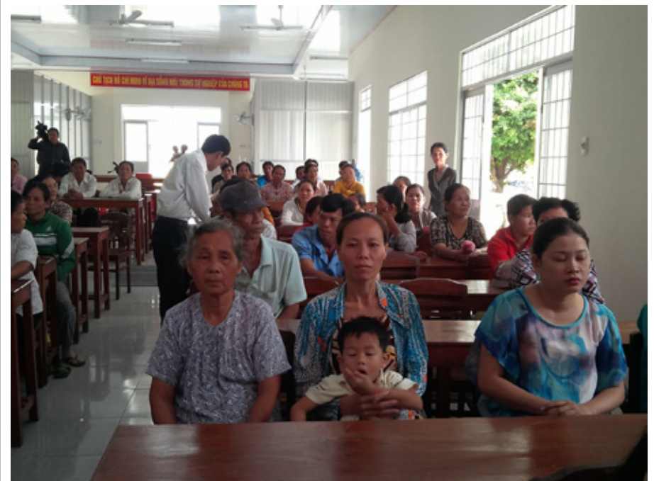
FIGURE 13 COMMUNITY-LEVEL TOILET REBATE CEREMONY IN TRA VINH PROVINCE IN THE MEKONG

of an unsuccessful NGO-private sector partnership for the production of a low cost toilet component. The reason why the venture was unsuccessful was put down to the failure to include a health sector government partner, who could have provided knowledge of the health system.