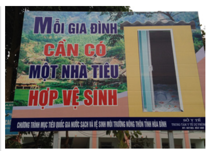
FIGURE 10 SANITATION PROMOTION AT A GOVERNMENT HEALTH CENTRE, MAI CHAU DISTRICT, HOA BINH PROVINCE

committed sub-national government staff, particularly in places where NGOs have recently been working, highlighted varied incentives that had inspired their actions.